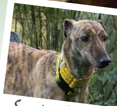
Sweet girl Clara