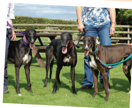
Left to right: Benny, Billy and Meg

Erin Hounds are proud to have helped a mother and her two sons all into loving homes this year. The gentle trio are Benny who is best friends with cats, Billy who now acts as a fosterer's assistant helping new rescues learn the ropes and Westmead Meg, their mother, who after having 3 litters of pups, finally got the peace and comfort she desires with lovely walks on the beach.