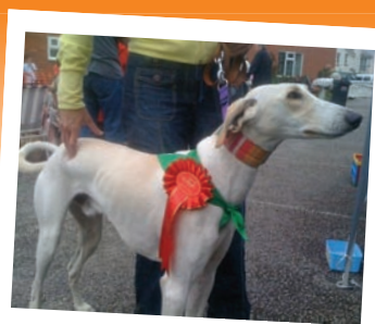
Marley "Most handsome dog"

Jack won "Dog in best condition" in Toft village fun dog show – Jack was surrendered into a rescue in Ireland with a nasty hock injury which had curtailed his racing career and rendered him of 'no value or use'. Having been nursed back to health and vitality by his adoring owners, Jack is now a great ambassador and a very keen (no pun intended!) fundraiser for Erin Hounds to whom he owes his life.