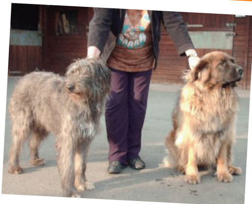
Rosalea and Saffie